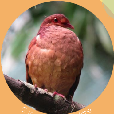
G. montana © Félix Uribe